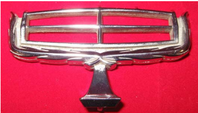
1973-4 Hood ornament

The first appearance of this badge is in 1969. The shield is divided into 4 blank red quadrants with a crown atop and a surrounding wreath from the bottom up the sides. The quadrants are divided by a black cross. This is also stylized into a hood ornament beginning in 1973. Seen on the trunk and wheel covers also.